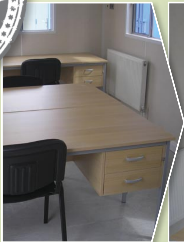
Large Office/Kitchen Facilities