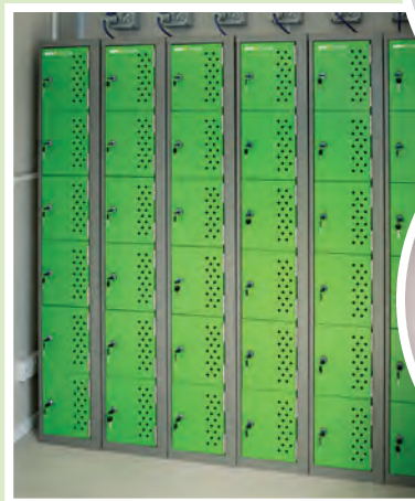
36 x separate powered SafeCharge lockers with 2 x 13amp power sockets and USB ports