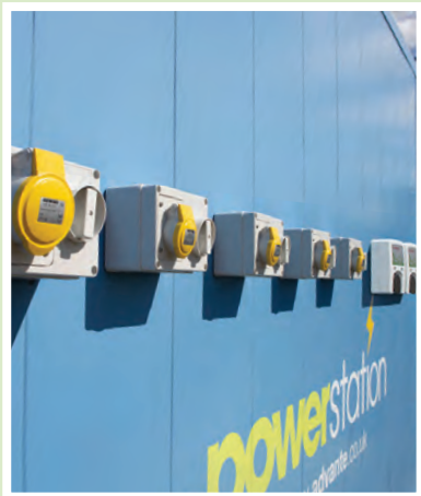
5 x 110v charge points and 2 x 240v electric vehicle type charge points (optional)