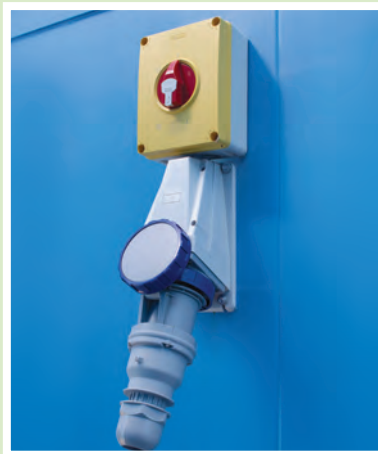
1 x 63amp IP67 plug socket for mains or generator connection