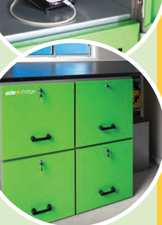
4 x powered SafeCharge drawers with 2 x 13amp sockets and USB ports