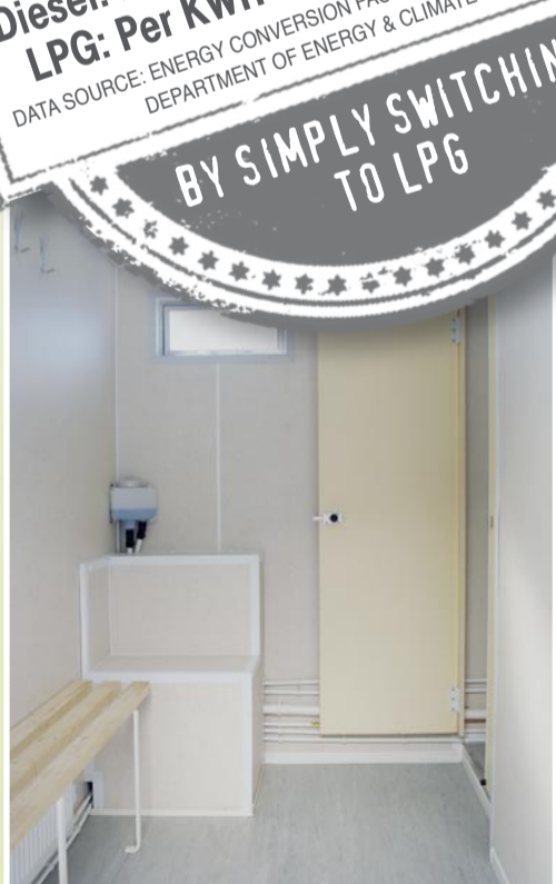
Toilet & Drying Room

19% REDUCTION IN CARBON FOOTPRINT Diesel: Per KWH output = 0.25 kg CO 2 e LPG: Per KWH output = 0.21 kg CO 2 e DATA SOURCE: ENERGY CONVERSION FACTORS CARBON TRUST WEBSITE. DEPARTMENT OF ENERGY & CLIMATE CHANGE. BY SIMPLY SWITCHING TO LPG