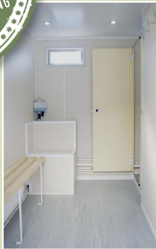
Toilet & Drying Room