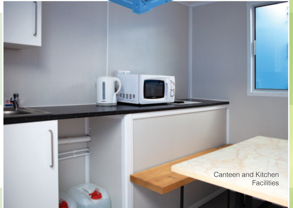
Canteen and Kitchen Facilities