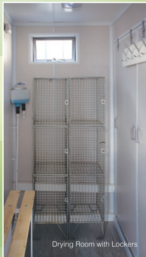
Drying Room with Lockers